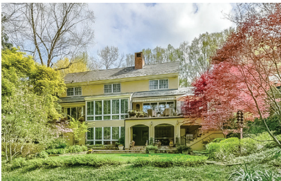
1134 SCOTLAND AVENUE Eastover / 4 Bedrooms / 4.1 Baths MLS# 3076769 / $1,890,000