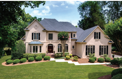
2801 JEM COURT Royden / 5 Bedrooms / 4.1 Baths MLS# 3096199 / $998,500