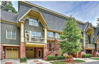
1036 ORIOLE STREET Dilworth / 3 Bedrooms / 3.1 Baths MLS# 3085312 / $560,000