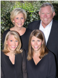
The Tuck Team 704. 904.4011