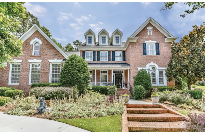
10604 MOSS MILL LANE Bexley at Ballantyne / 4 Bedrooms / 3.1 Baths MLS# 3096452 / $509,000