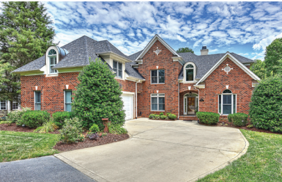
5015 REA ROAD 4 Bedrooms / 2.1 Baths MLS# 3090409 / $499,000