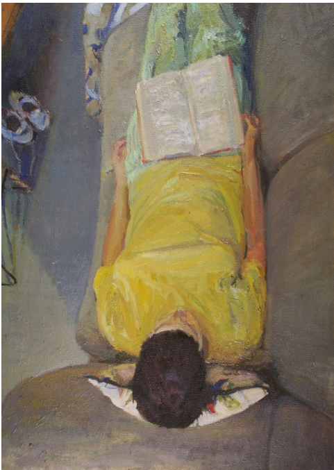
On the Couch by Greg Siler 21” x 15” oil on canvas

Contact us for information on Elder Gallery’s art learning curriculum.