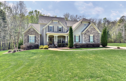
9615 BALES LANE Waterleaf / 4 Bedrooms / 5 Baths MLS# 3076863 / $579,000