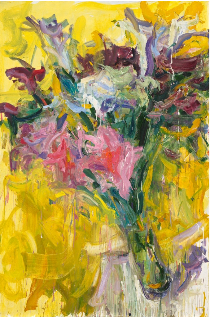
Carnival Venice by Carl Plansky 72” x 48” oil/linen

2015 Artist Invitational 4 Sept — 26 Sept Our choices of new artists to watch.