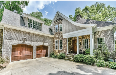
2677 IDLEWOOD CIRCLE Myers Park / 5 Bedrooms / 4.1 Baths MLS# 3089955 / $1,250,000