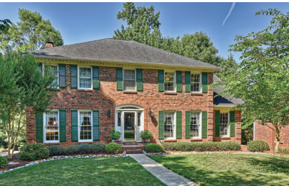
7934 SUNNYVALE LANE Wolfe Ridge / 4 Bedrooms / 3.1 Baths MLS# 3095633 / $505,000